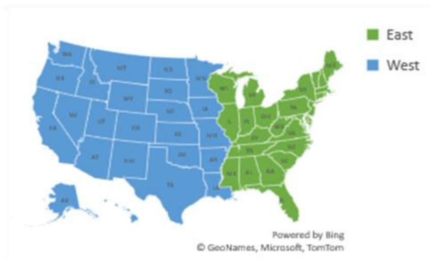
Figure 2. Origin State Map – Transportation Regional Contact (as referenced in Table 9)